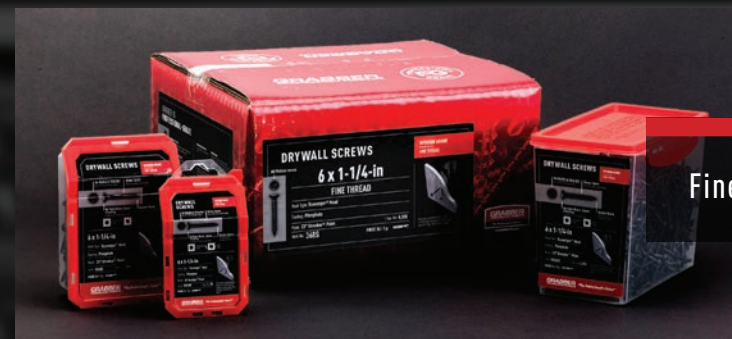
Fine Thread Steel Screws