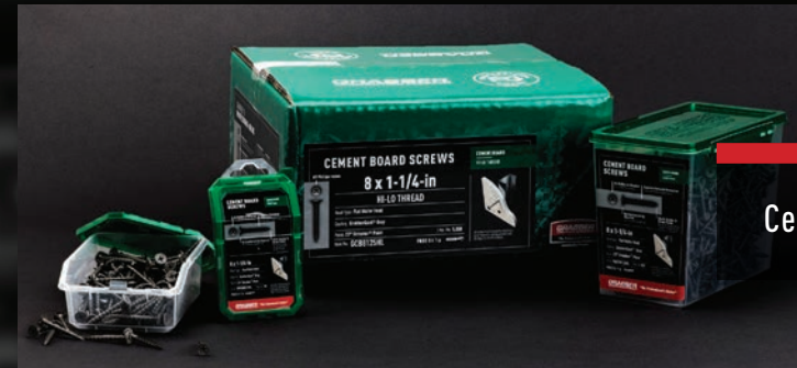
Cement Board Screws