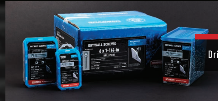
Drill Point Heavy Gauge Metal Screws

Each Grabber Category comes with its own easily recognizable color coding system: