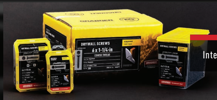
Interior Coarse Thread Screws (Wood)