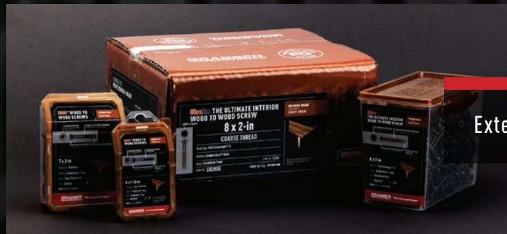
Exterior Coarse Thread Screws (Wood)