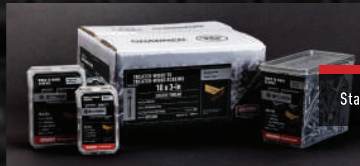
Stainless Steel Screws